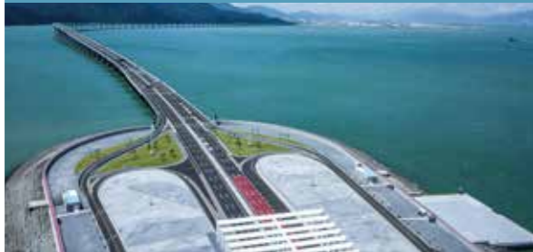
CHINA Hong Kong-Zhuhai-Macau Bridge